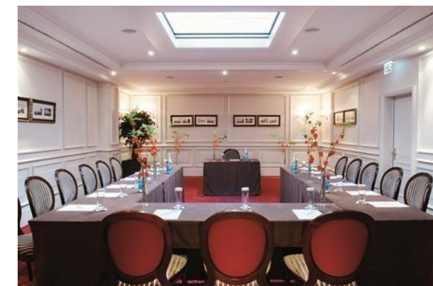
Salon Eaux Vives, 688 sq ft

Organize a unique event in the neoclassical setting of the Hotel Royal (202 rooms). Its warm atmosphere offers 500 sqm of modular surfaces, with meeting rooms from 55 to 277 sqm bathed in daylight. Guest-oriented team, all the latest technologies and sense of hospitality, we help ensure a resounding success for your event.