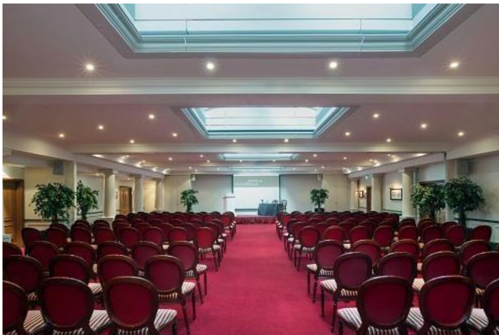
Salon Rousseau, 2981 sq ft