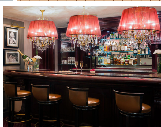
The Bogie's Bar