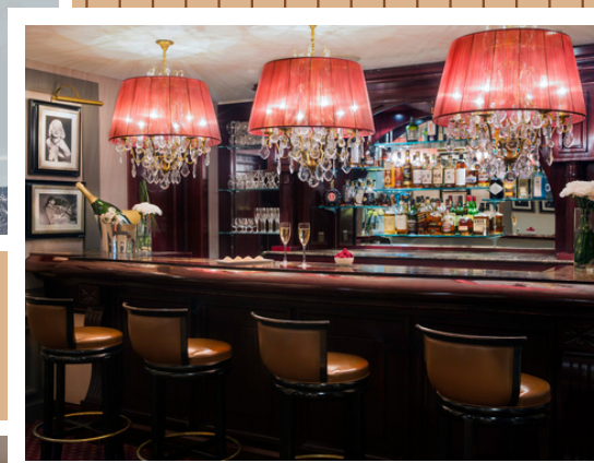
The Bogie's Bar